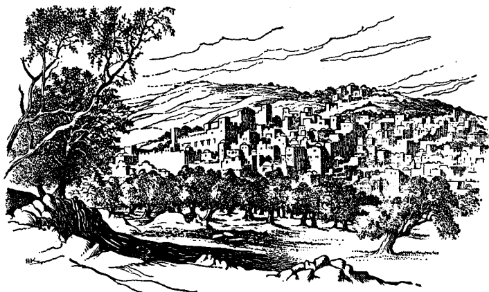
Heboron hae sâko

12 Eme Abenezi Dawidirao kiñaj sorec-jopahuc muwec, "Mâreñ zi more? Nâhâc zâzâfic-nâhec moc bâfuanac, eme no gohec juhuc Israe ñic gorao zuhuc-jopa-fârepemu." 13 Iñuc mume Dawidizi dâj zîjuc bâtikiecnewec: