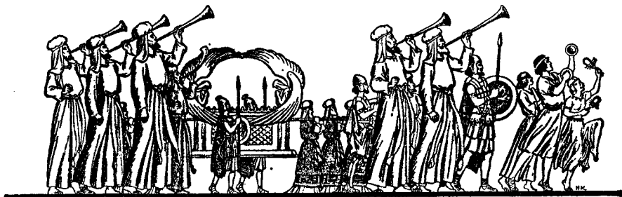
Wofuɲte zâzâfic katapa ɲɛɲkɛngopɛɲ

12 Juku ɲicwofuɲ Dawidi zɲuc âzâcnembiɲ: "Anuturɛ katapare erâ Wofuɲzi Obededom â wiacfâcne, erâ wiac sasawa ehâmo-jarekac." Iɲuc